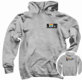
Pullover Hoodie $50.00 ● ● ● ● ●