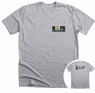
Premium Unisex Tee $32.00 ● ● ● ● ●