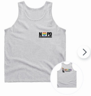
Classic Unisex Tank Top $30.00 ● ●

Click Here To Order Your NAPD Pride Merch